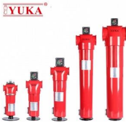
Compressed Air Filter