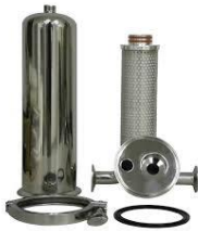
Sterile / Gas Filter