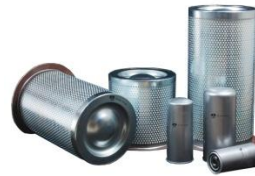
Oil / Water Separator