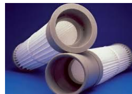
Dust collector Filter bags and Cartridges