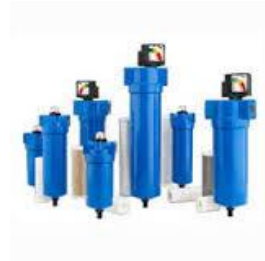
Compressed Air Filter