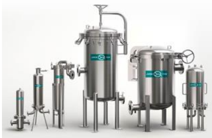
Sanitary Process Filter housing