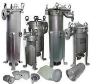
Filter Bag housing