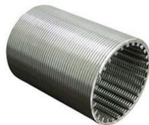
Wedge Wire Screen