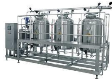
Sanitary Skid CIP System