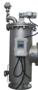
Self Cleaning Filter (Viscous)