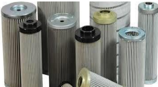
Sintered / Pleated Filter Elements