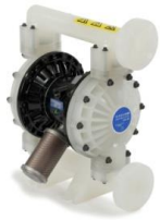
Air Operated Diaphragm pump