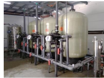
Pre- Treatment System