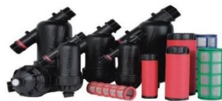
Disc / Washable filter