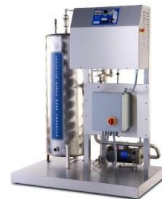
Ozone Desinfection System