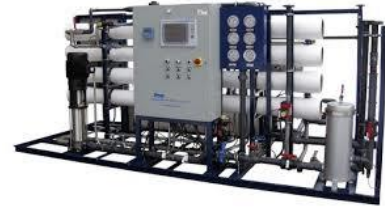
Industrial UF / RO System