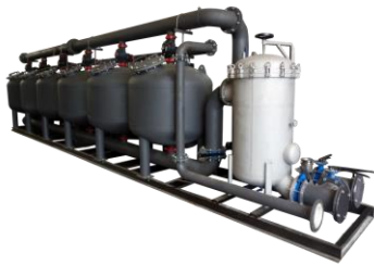
Multi Media / Activated Carbon System