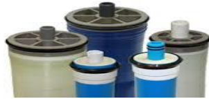
UF / RO Membrane