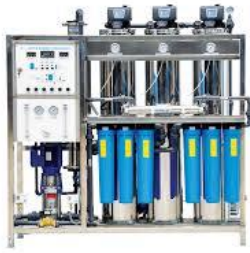
Reverse Osmosis System