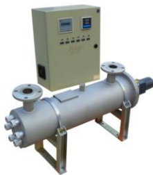
UV Water Sterilizer System