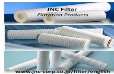
Absolute Chisso/ CP Filter